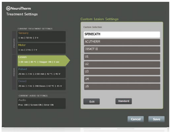
Treatment Settings Screen