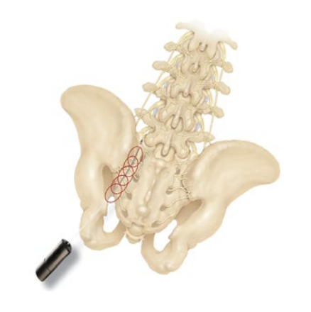
RF Probe for Sacroiliac (SI) Medial Branch Denervation