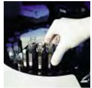
Load barcoded samples