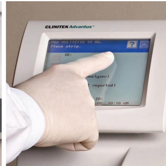
Color touch screen