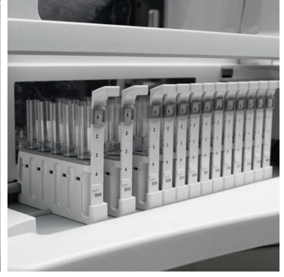
Sample rack holds any size tube