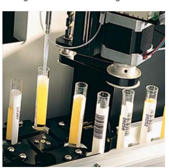
Direct-to-track automation connection