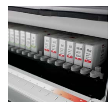
Refrigerated onboard reagents