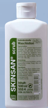
The 500 ml bottle for the wall dispenser.