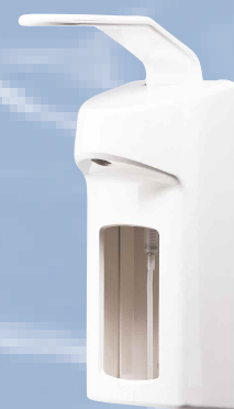
The wall dispenser