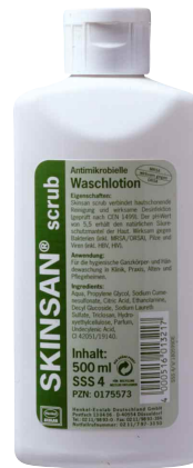
The 500 ml bottle for the wall dispenser.

We offer complete service and systems to cover all of your institutional, industrial, and hospital cleaning and sanitation needs. Ask for more of our products and services in Europe and worldwide. Henkel-Ecolab – Your partner for Total Hygiene Solutions! www.henkel-ecolab.com