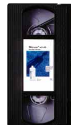
Our sales organisation can put a training-video with instructions for the washing of immobile MSRA colonized patients to your disposal

We offer complete service and systems to cover all of your institutional, industrial, and hospital cleaning and sanitation needs. Ask for more of our products and services in Europe and worldwide. Henkel-Ecolab – Your partner for Total Hygiene Solutions! www.henkel-ecolab.com