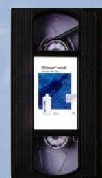
Our sales organisation can put a training-video with instructions for the washing of immobile MSRA colonized patients to your disposal